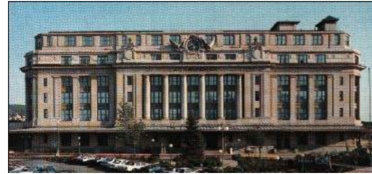
Erie Lackawanna PA Bennington VT