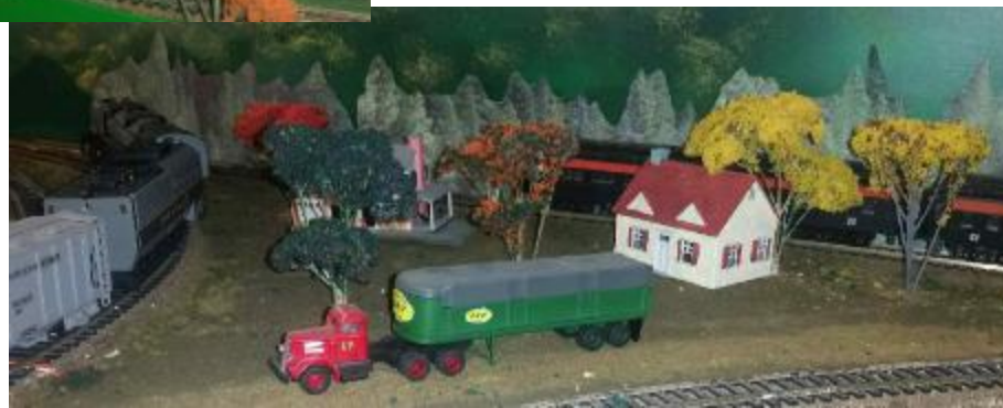
Paint, Paper, Trees & N scale on HO